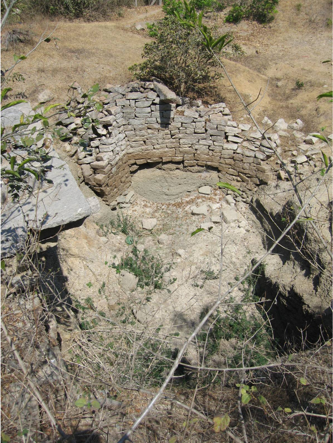
Figure 3. A south Indian dug well gone dry, now left in ruin.