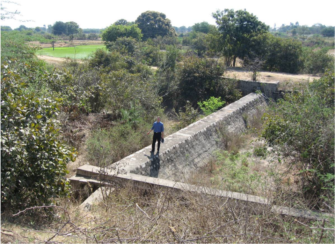
Figure 2. A naturalized, abandoned tank in Andhra Pradesh, India.