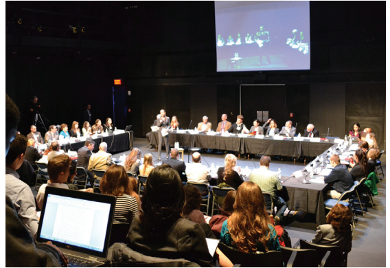
Sigma Xi and the Institute on Science for Global Policy co-sponsored a conference in April at Ursinus College titled "Safeguarding the American Food Supply." The Society and ISGP also co-sponsored a similar conference at Eckerd College on food security.