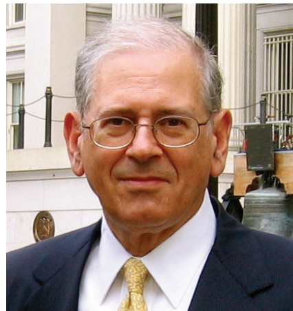
Dr. Robert E. Kahn is developing a concept to manage digital information over long periods of time.

There are three components of the architecture. One is something we call the digital object repository, which basically provides a means of accessing these digital objects via their identifiers. Second, if you don't know the identifier, you need a way of acquiring it and so registries store metadata about these objects; those registries can be searched. Once you've got these digital object identifiers, which we call handles, you need to go from the identifiers to a repository where you can access the information. Today, there are thousands of organizations around the globe that are running what we call local handle services. There is also a Global Handle Registry that knows where the local handle services are located.