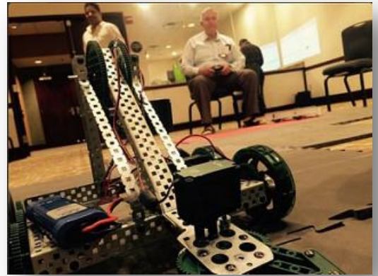
Robotics Showcase at the 2015 Sigma Xi Annual Meeting