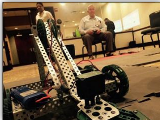
Robotics Showcase at the 2015 Sigma Xi Annual Meeting